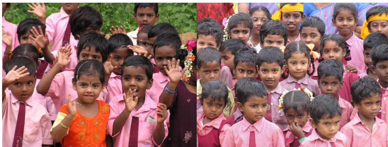
The children in two of READ's schools, the Mother Teresa school of Periyakrishnapuram (left) and the Jawahar Matriculation School (right).

Women empowerment has been an ongoing program for the past 6 years, through self-help group (SHG) formation, education, capacity-building and skill training, micro-credit and savings activities, and resource mobilization. In this reporting year, the following activities were undertaken: