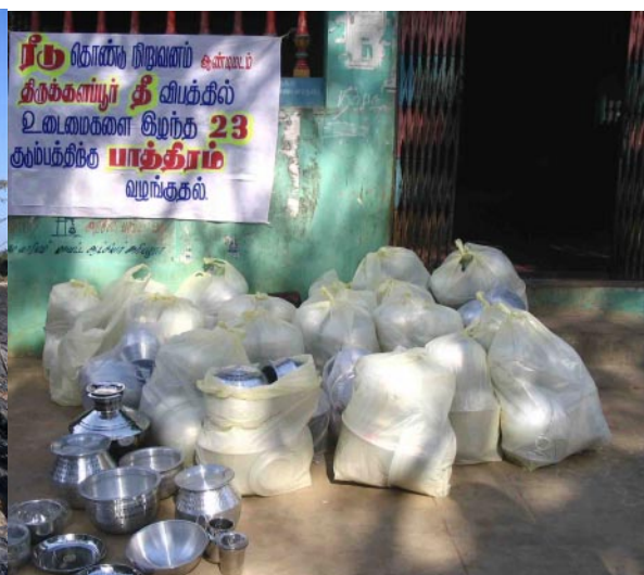
A fire in Tirukalapur destroyed many houses. READ helped the people by purchasing and distributing kitchen and food items.