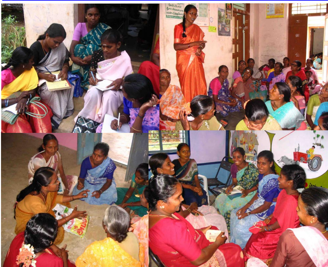
The women self-help group members discuss and select candidates to become peer health educators to promote correct awareness on HIV.