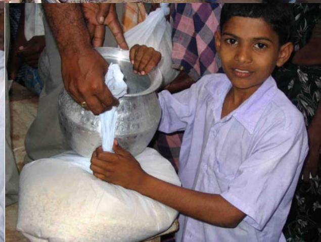
Tsunami relief efforts: READ and other NGOs sent food and kitchen supplies to some of the coastal villages in Cuddalore district that were devastated by this terrible tragedy.