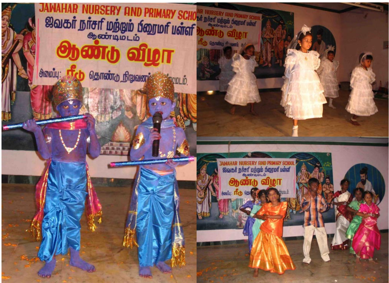
Children perform at the Annual Day of the Jawahar Matriculation School in Andimadam.