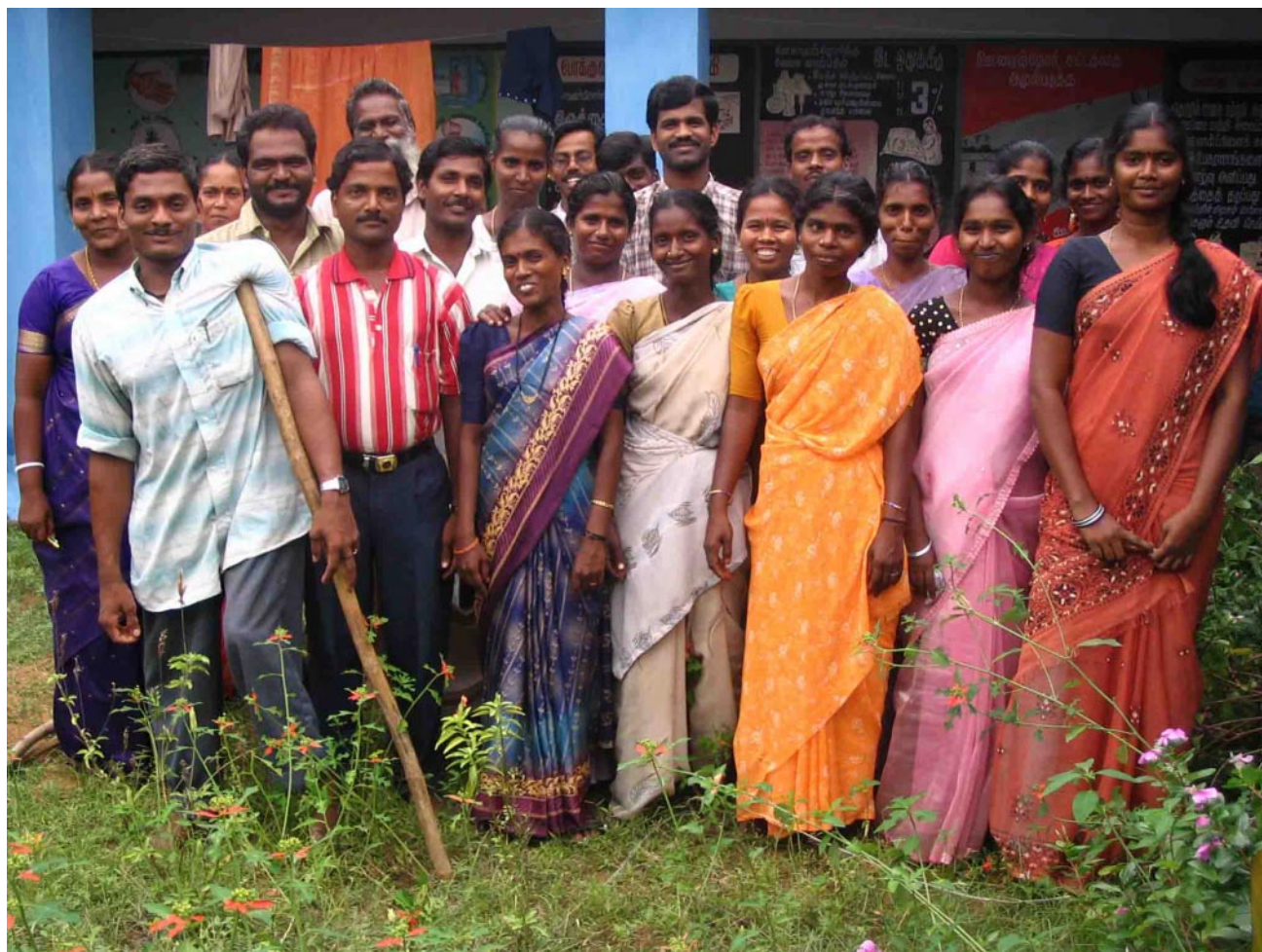
The Outreach Workers of the Perambalur Education and Prevention Program for HIV/AIDS.

PEPP was launched during January 2005, thanks to a generous grant from the Elton John AIDS Foundation (UK). It is a district-level massive HIV/AIDS awareness and prevention program to reach the general public with correct information on transmission, prevention and care. It is supervised by a Community Advisory Board consisting of 15 members representing a broad cross-section of the community. Twenty Outreach Workers representing the AIM network of NGOs are the key