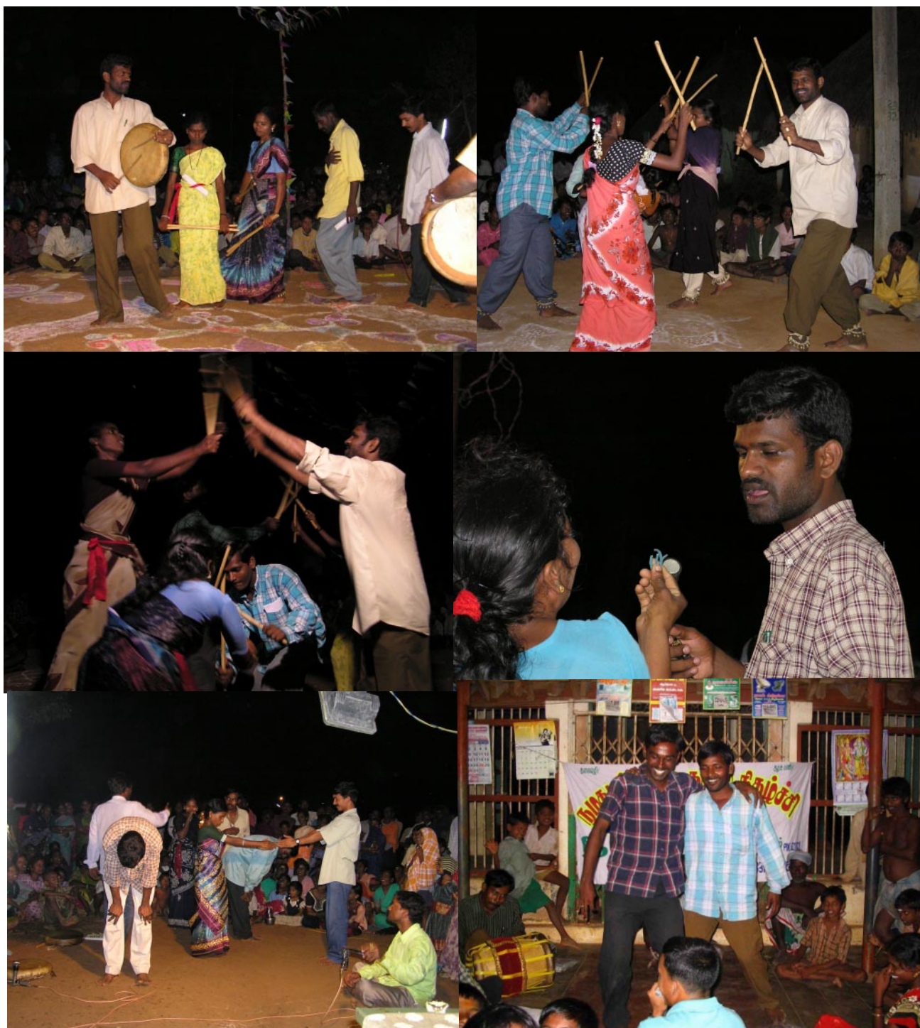
During the evening, READ's cultural team uses street theater to spread awareness on disability, HIV, sanitation and environmental issues to rural communities.