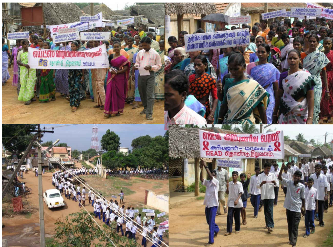
HIV/AIDS awareness rally organized by READ in Andimadam on December 1, 2004.