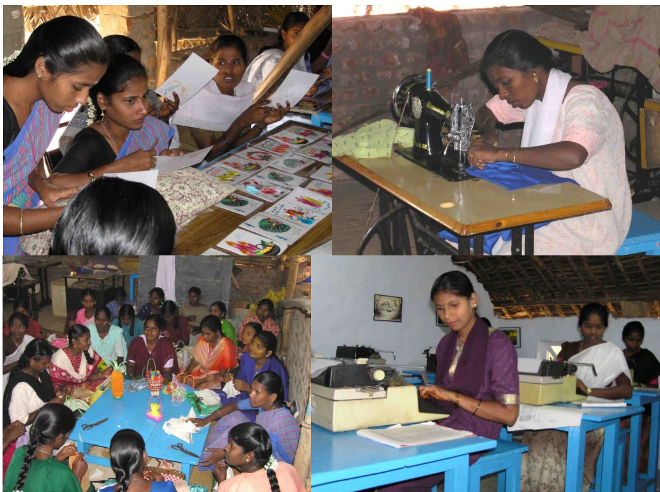
READ offers skill-training programs in card production, tailoring and type-writing to girls and young women from underprivileged families.