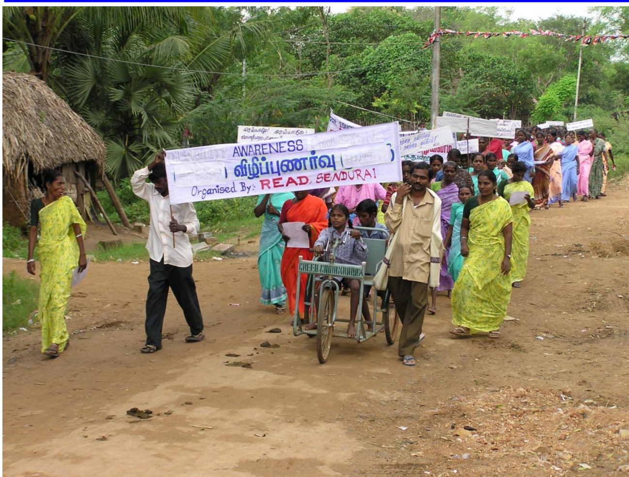
Awareness rally on World Disability Day (December 3, 2004), organized by READ.