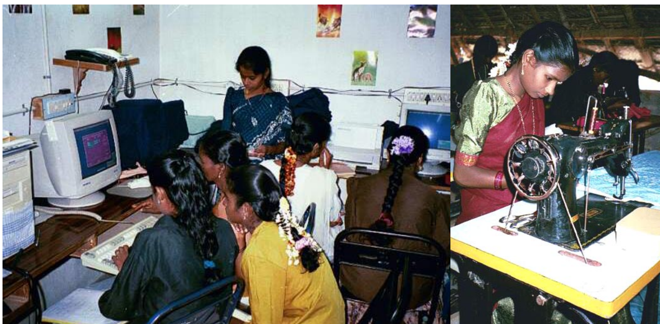
Job-oriented skill-training programs offered by READ

All these trainings have been conducted in two batches, each for 6 months (March to August, and September to February). A total of 118 young women and men have benefited from these training programs.