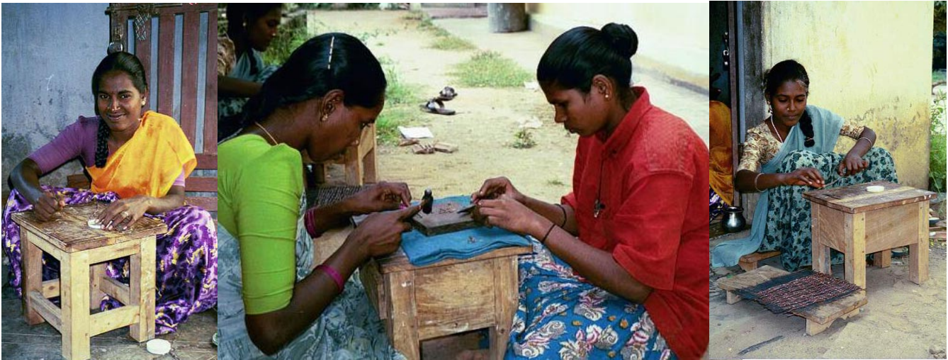
The Anna Salai women self-help group of Keelneduvai has started an ornamental chain production unit to improve their economic status.

project. As visualized this was successfully implemented with the following activities.