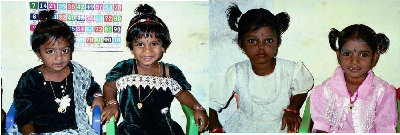
Students of the Mother Theresa school in Periyakrishnapuram.