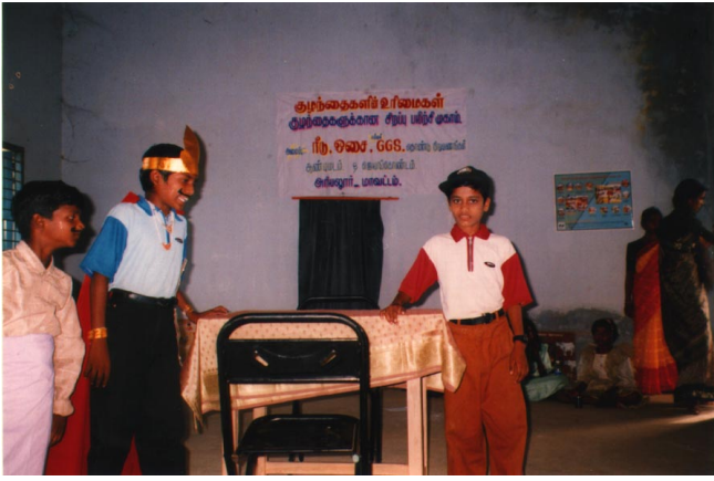
Child rights awareness campaign: students play the “Katta Bommanna drama to learn about children rights