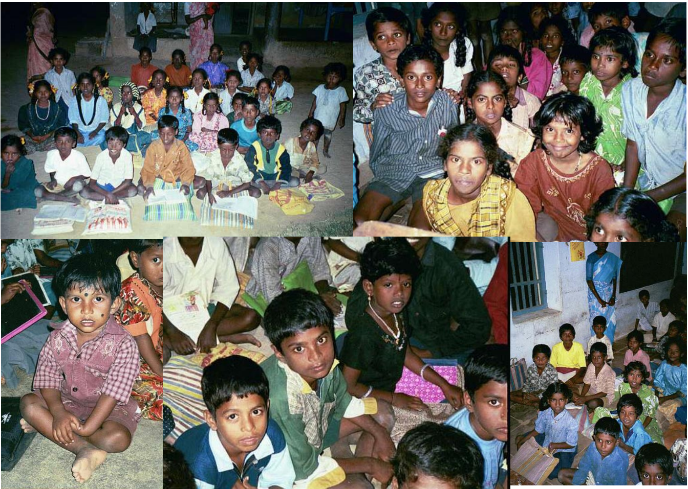
The evening tuition centers in the villages provide coaching and guidance for the students, and the attendance is always great! Learning and studying together is productive and fun!