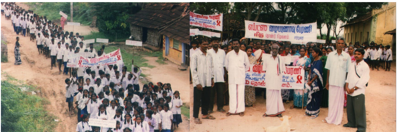
AIDS rally of school students and self-help group members at Anandavadi village of Sendurai block.

In three villages – Elaiyur, Ananthavadi and Andimadam-, an AIDS awareness rally was organized on three different days starting from World AIDS Day (December 1 st ) onwards. About 1500 youth students and women in SHGs participated in these rallies with slogans, banners, placards.