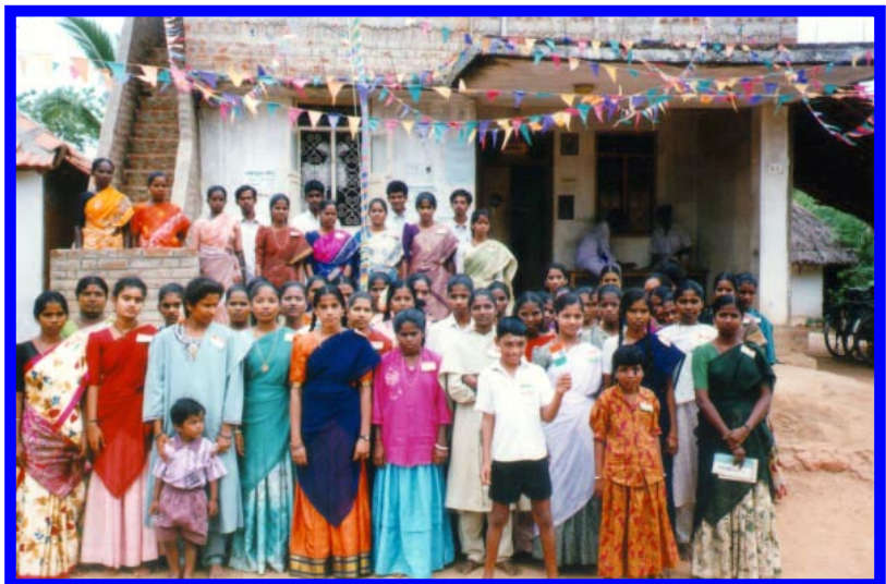
The office staff of READ together with trainees and students on Independence Day.