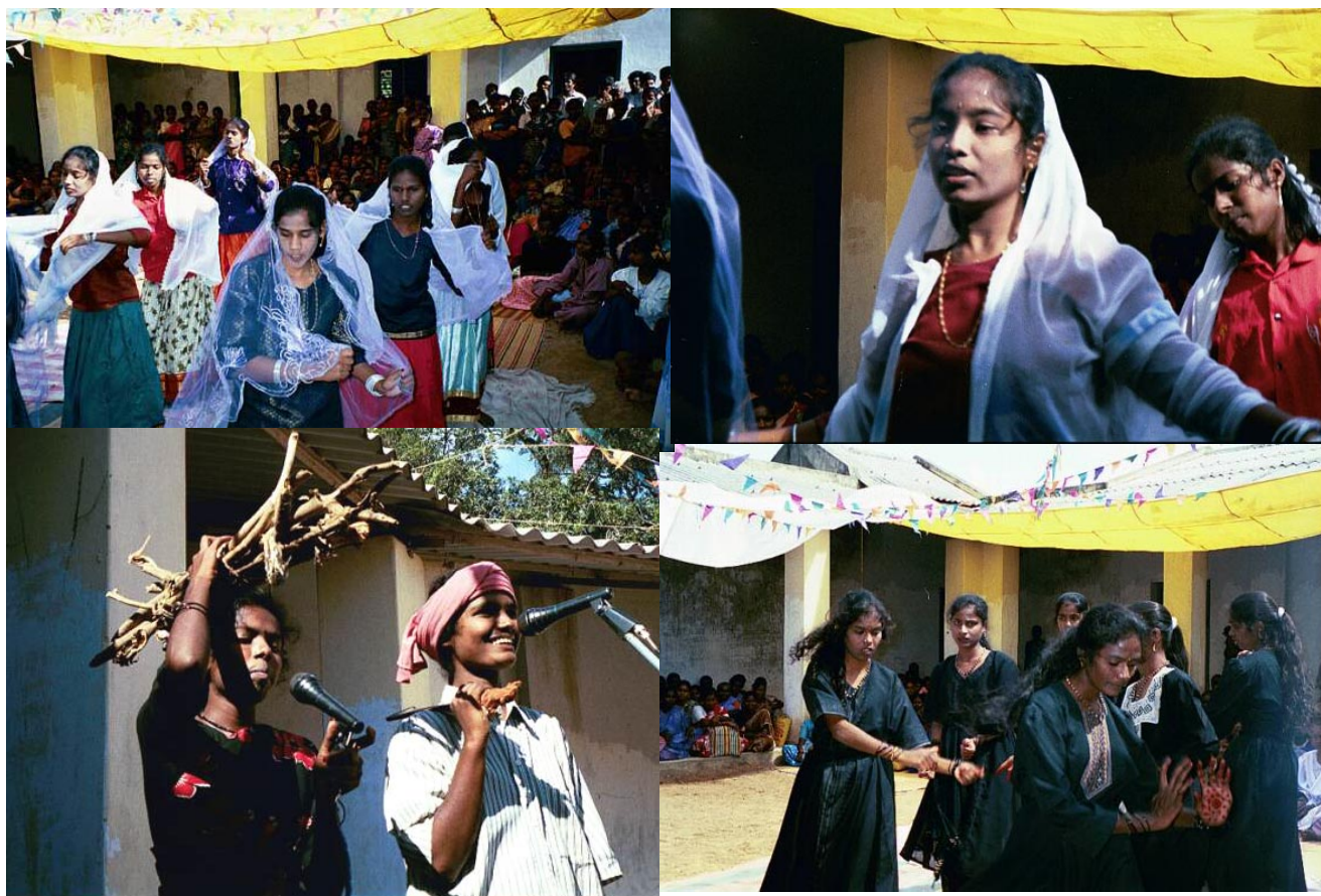
The READ trainees performing dance at the Annual Day of READ (Jan. 24, 2001)