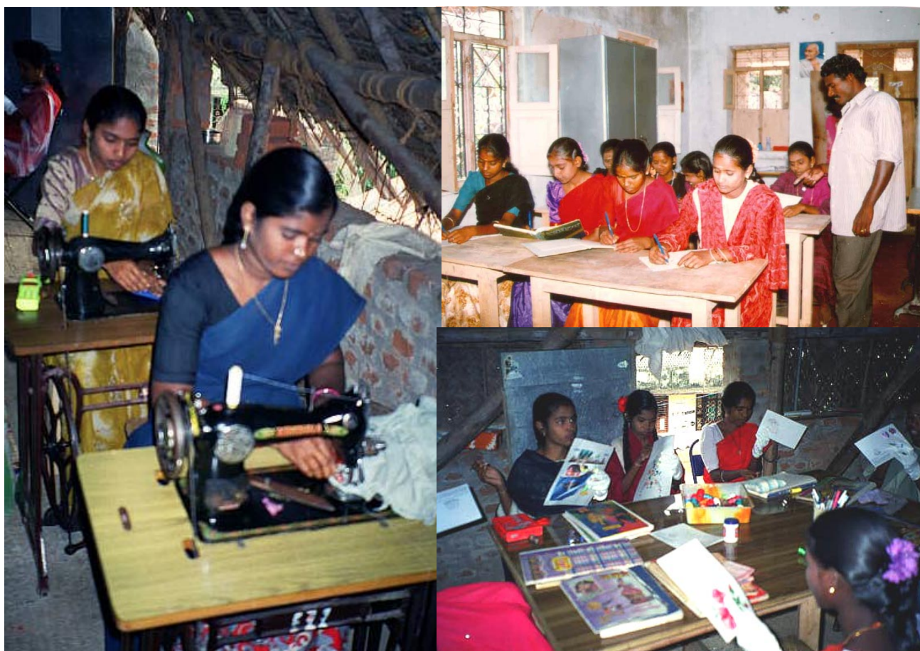
READ offers training classes, including sewing, computer training and greeting card production.