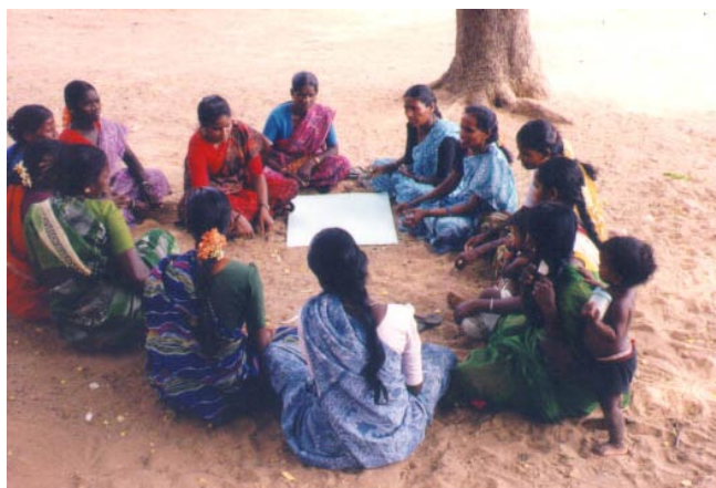
Self-help group members discussing their activities.

An extensive survey was conducted to enumerate the number of disabled children in the District and in the Block, particularly mentally disabled children. This is both to understand the disability situation in this area and also to inform parents on the institutional service available at READ for mentally disabled children. These survey data were compiled which gave us an idea to go for a community-based rehabilitation program in the future.