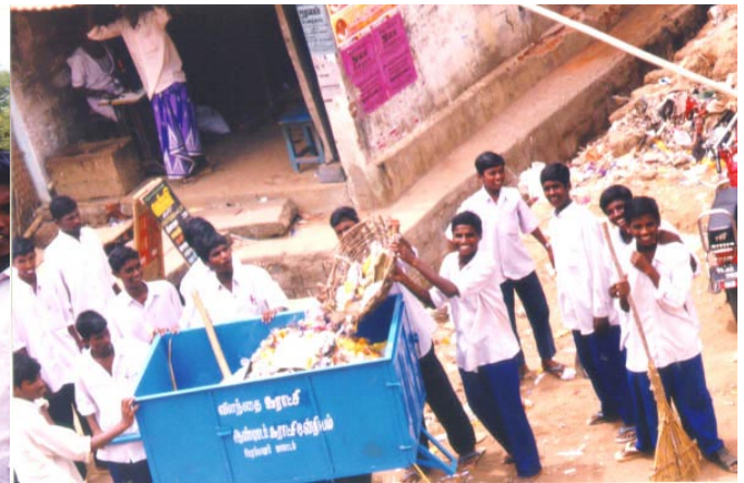
National Service Scheme students together with their coordinator during the 'clean village day'