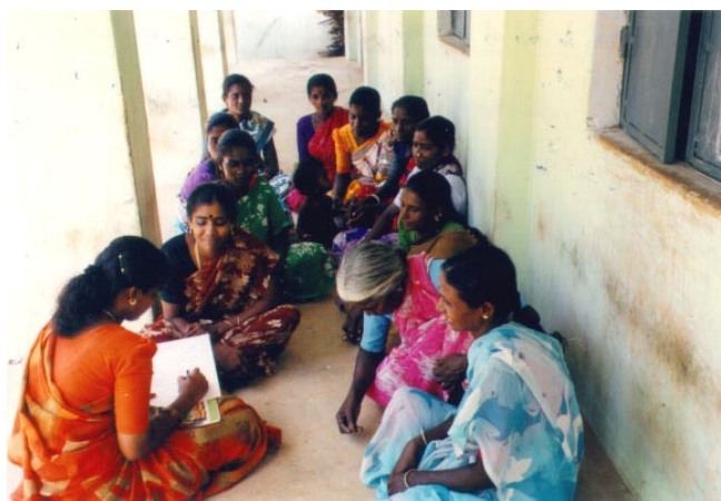
Group discussion on mother & child-care at Kovilvazkkai village.