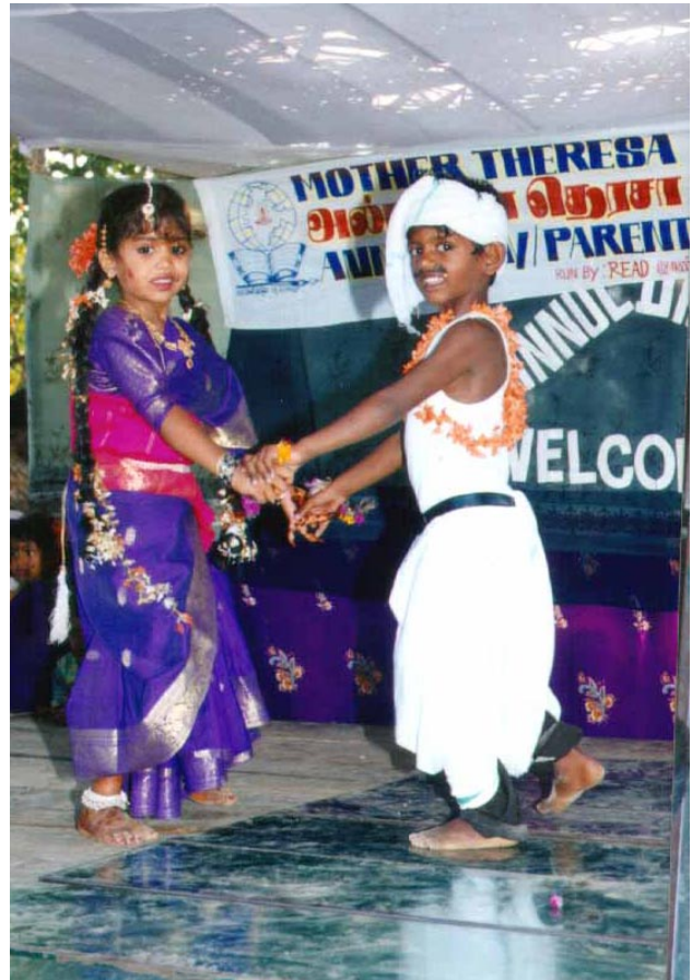
Two students performing during the annual day of the Mother Theresa Kindergarten Schools

At this juncture, I must thankfully place on record the services rendered by our staff in achieving all these programs in this reporting year.