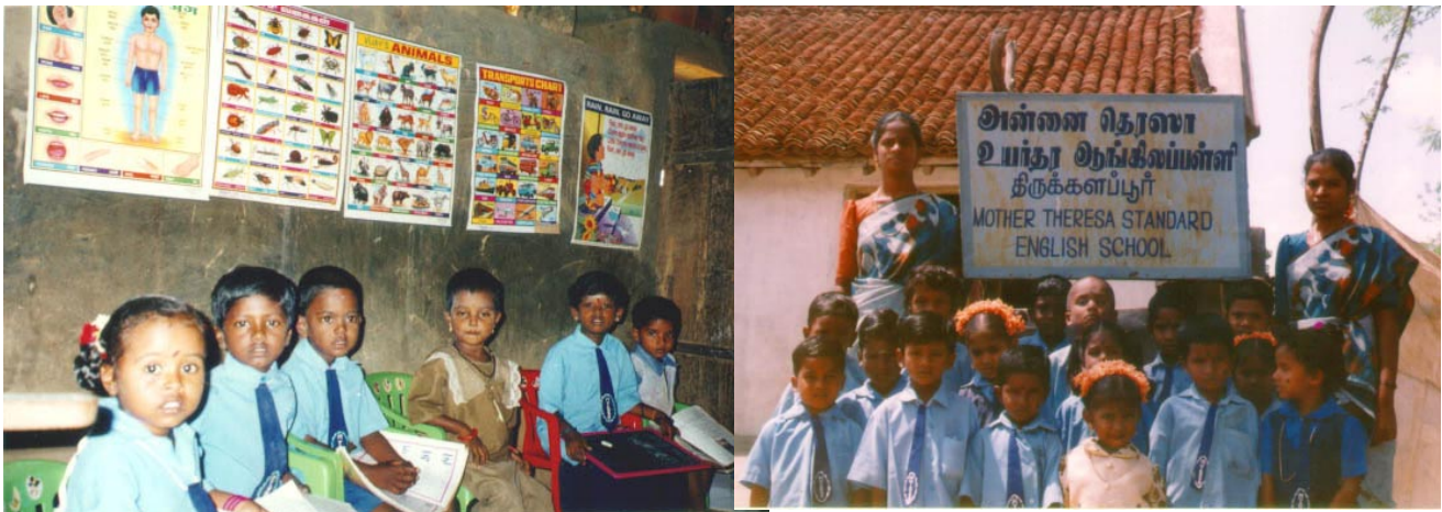
The Mother Theresa Kindergarten Schools at Periyakrushnapuram (left) and Thirukalapur (right).