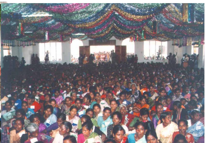
Many women participated in the rally and general meeting on World Women's Day