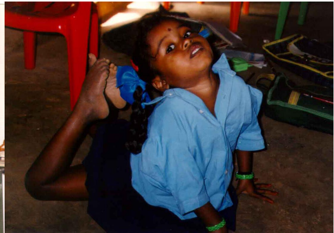
The students at the Mother Theresa get instruction in many disciplines, including yoga.