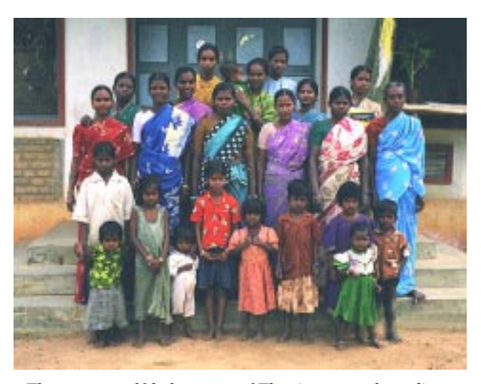
The women self-help group of Thanjavooranchavadi.