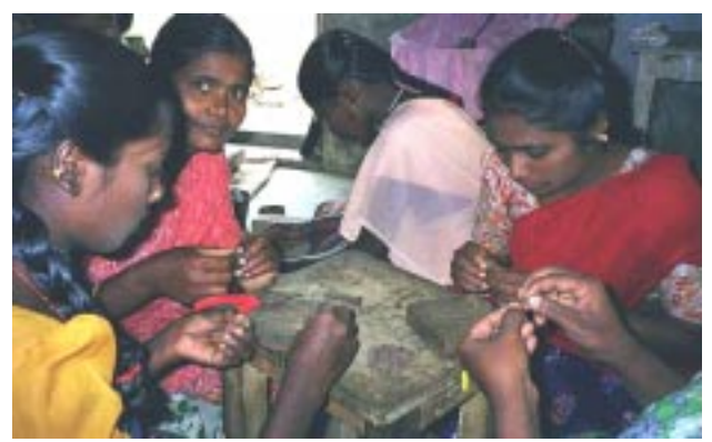
The Annal Women self-help group of Keelneduvai is receiving training in ornamental chain production