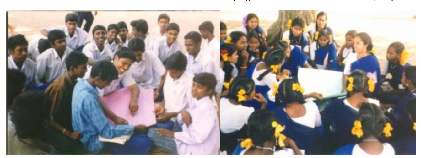
Students discussing problems of pollution during our National Environmental Awareness Campaign.

Child labor is a common problem in villages, which persists among poor and laborer families. To augment the family income, the children are forced into labor work, and are thus deprived of their education, childhood enjoyments and many other privileges. In this area, child labor occurs mainly in 2 forms, (1) in family-oriented works, i.e., in agricultural labor activities and (2) in other occupations like silk weaving. To reduce this child labor, the above-stated educational awareness campaign was conducted. In addition, a special