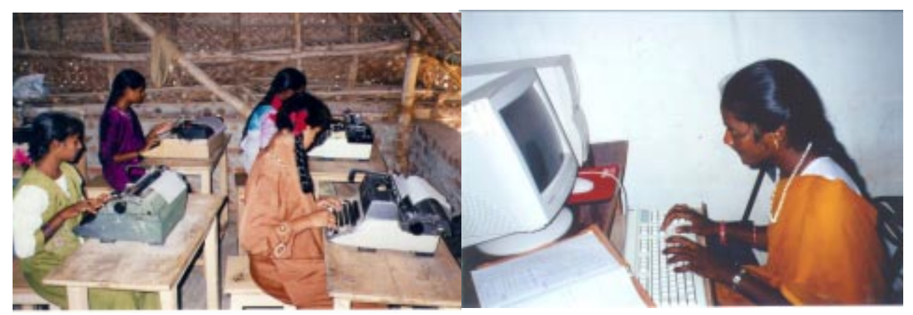
The secretarial trainees learning typewriting and computer skills.

In this reporting year, no government programs were made available to READ. However, the ongoing paid training programs of READ – tailoring, typewriting, greeting card production and