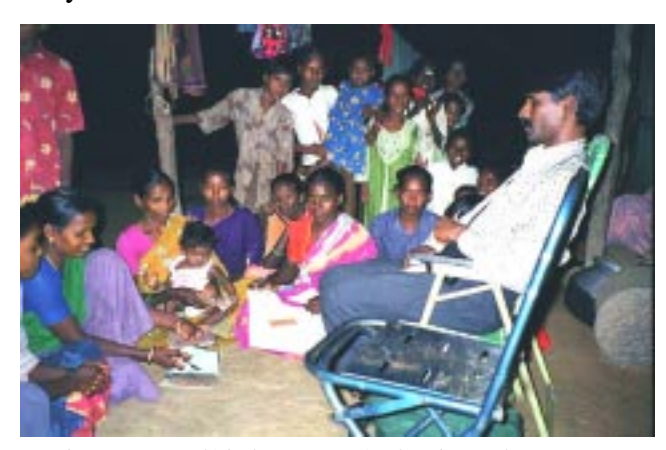
The women self-help group of Vilandai Colony.