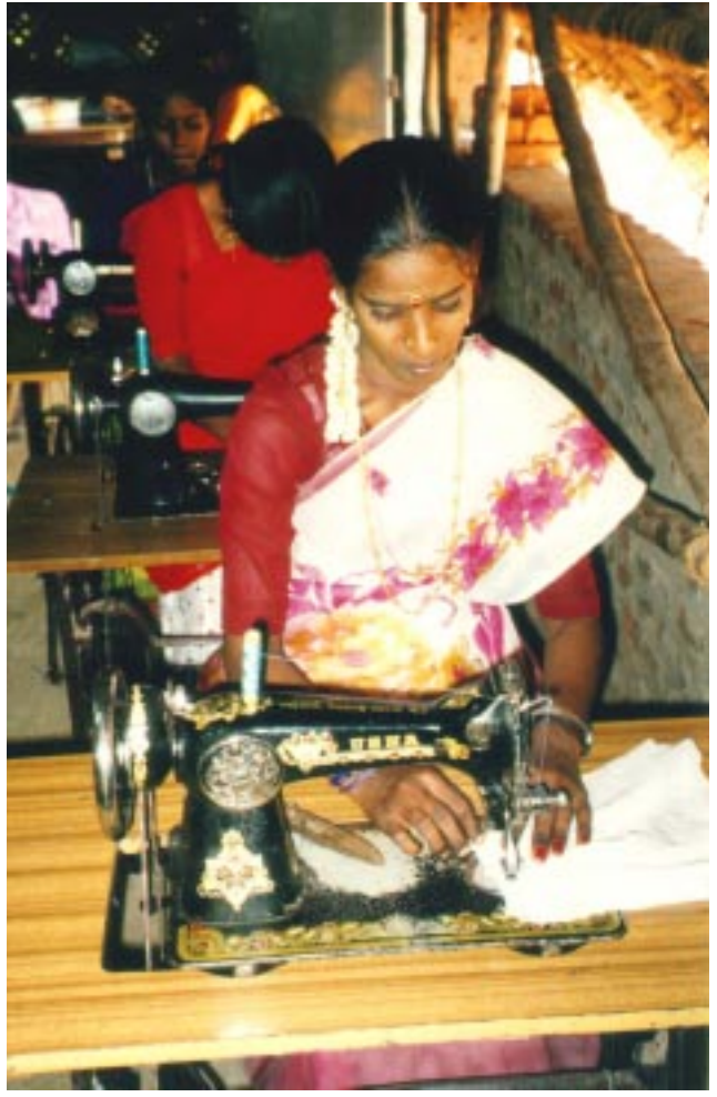
The tailoring trainees.

computer training—were continued. These courses were provided as follows: