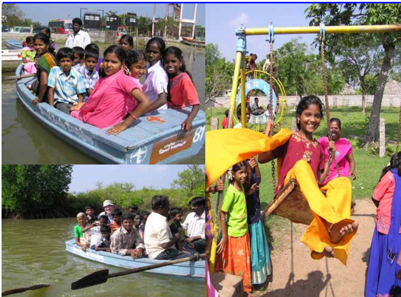
On December 28, 2008, we took many of the sponsored children and Hope Walks children to Pichavaram for a boat tour through the mangrove forest. The kids (and adults) also enjoyed the play garden.

The sponsorship generally meets the cost of food, educational materials, school fees, school uniform dress, summer camp and tours. Some sponsors individually contributed for the special needs of their sponsored children such as bicycles, reading desks and so on. The sponsorship for HIV-infected children includes also the cost of their medical and nutritious needs.