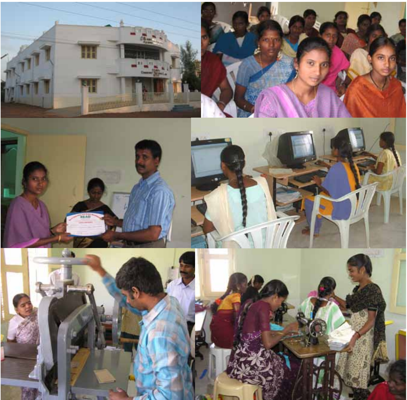
In the newly constructed READ's Community Resource Center (RCRC), READ continues to provide a variety of vocational skill-trainings to adolescent girls and disabled people.

Skill-training is one of the ongoing programs since the inception of READ. In the beginning