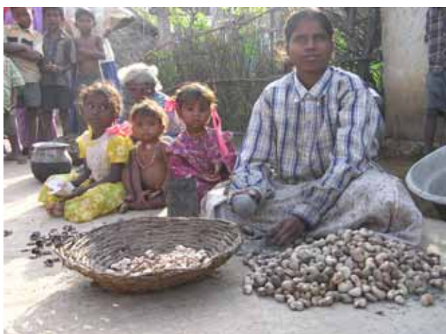
A self-help group member is processing cashew nuts.

Savings and internal micro-crediting is an integral activity of these SHGs and has a great impact on their economic life. The micro-finance program discussed later in this report added strength to this activity and made them economically independent.