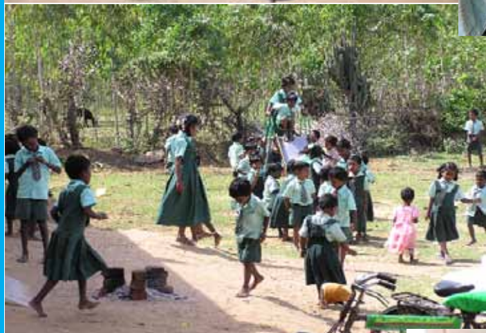
The Mother Teresa Standard English School (Periyakrishnapuram village), of which construction was completed in 2008, provides basic education to many children, most of them from low-literacy and poor farming families.